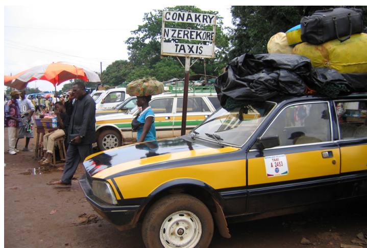
An overloaded Peugeot 505 at a taxi stand in Conakry

Unions of transport operators are active in each commune. Originally drivers' unions, the groups have many members who have become owners; indeed, the unions themselves may own some vehicles. Affiliated with the FSNP-TMG (Transport and General Mechanical Engineering Federation), the unions manage road transit centers in each commune. Union agents (three to six per transit route) supervise traffic and deal with accidents. In other respects, the unions differ from