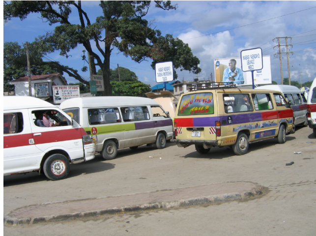
Dala-dala operators in Tanzania

Since legal operations began in 1983, the dala-dala (the word comes from dollar-dollar) fleet has been quite diverse. Most vehicles are imported second-hand from Japan and the Middle East. Popular makes and marks are the Toyota Hiace, Toyota Coaster, Isuzu Deluxe, and Mazda. Capacity ranges from 18 to 35 passengers. The Toyota Hiace, with a capacity of 18 passengers, is the most popular. Altogether, approximately 7,000 dala-dala vehicles owned by some 3,000 operators ply 190 routes in the city.