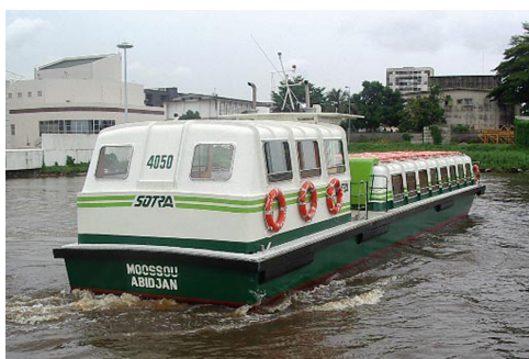
A fleet of “boat buses” connects parts of Abidjan separated by a lagoon

Vehicle importation and initial inspection are handled in a structured manner by a branch of the Ministry of Transport, the Service Autonome du Guichet Unique Automobile , or one-stop shop, while regular inspections are carried out by a private concessionaire, Société Ivoirienne de contrôle technique automobile (SICTA, a subsidiary of SGS). The government sets bus fares. The operators of buses and minibuses are organized into several associations and unions. The Syndicat National des Transporteurs de Marchandises et de Voyageurs de Côte d'Ivoire (SNTMVCI) is one of the national associations of operators. Unions perform self-regulatory functions.