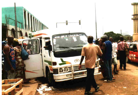
Minibuses provide about 19 percent of the city's urban transport