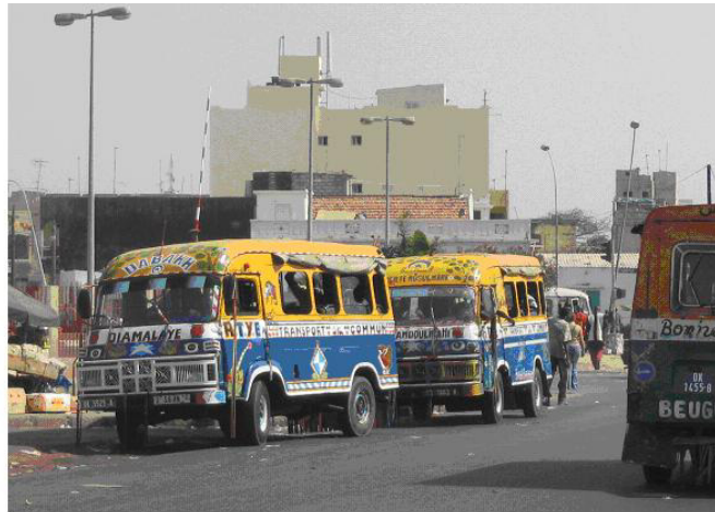
Cars rapides awaiting passengers in Dakar

In the past, efforts to provide route monopolies to DDD have not protected it from competition—indeed, the private sector has long met most transport demand. The cars rapides are by far the most common form of road-based public transport in the Dakar area. The fleet consists almost entirely of imported second-hand commercial vans, mainly Mercedes or Renaults, which are converted to passenger use on arrival. The reason for converting vans, rather than buying