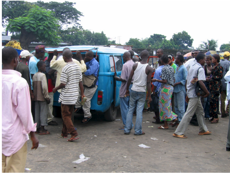
Would-be passengers vie for space on an old VW minibus

Approximately 1,200 minibuses, imported second-hand, specialize in short-distance trips. Lacking in comfort and safety, they respond to incentives to transport as many passengers as possible, providing more than two-thirds of all transport services in Kinshasa. Seating capacity ranges from 5 to 26, but minibuses may carry up to 50 passengers. Vehicles are poorly maintained; there are no requirements or facilities for regular maintenance. Service is unscheduled and chaotic; passengers may wait for hours for an overcrowded bus. The poor condition of the roads and congested traffic exacerbate the situation. The union of informal bus operators is the Association des Chauffeurs du Congo.