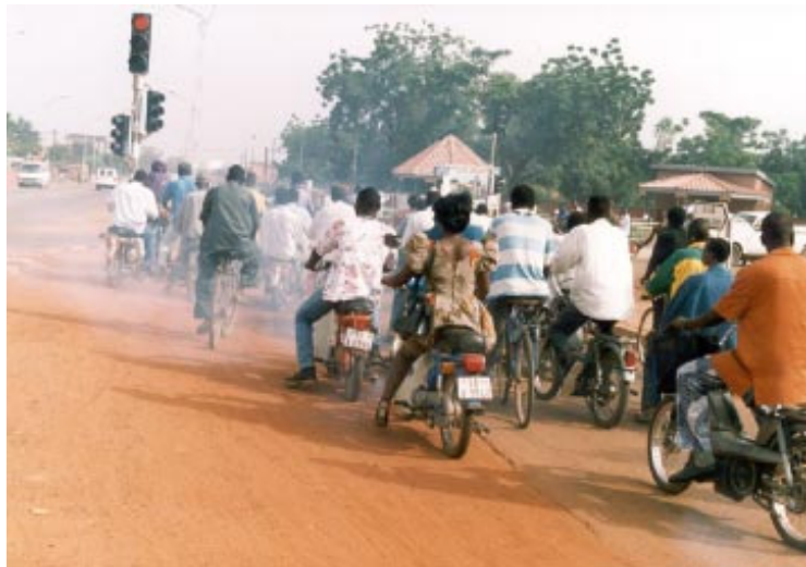
Motorcycles have caught on among urban Burkinabè

A fleet of 50 large buses (of which only about 33, and sometimes as few as 16, are operable) is operated by SOTRACO, a limited liability company created in 2003 to