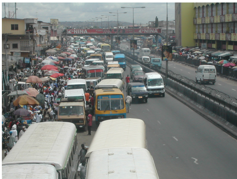
Spillover at a bus stop in Accra blocks an arterial highway

Permit fees are very low (as little as $4 per year). Assemblies are reluctant to impose unilateral increases for fear of losing income to a neighboring assembly. Permits are issued on demand to any qualified driver whose