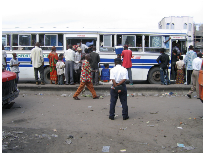
A full bus takes on more passengers in Kinshasa

STUC's fleet consists of 180 large buses and 36 minibuses—together the fleet provides 31 percent of Kinshasa's urban transport. The buses, made by India's Tata company, are two