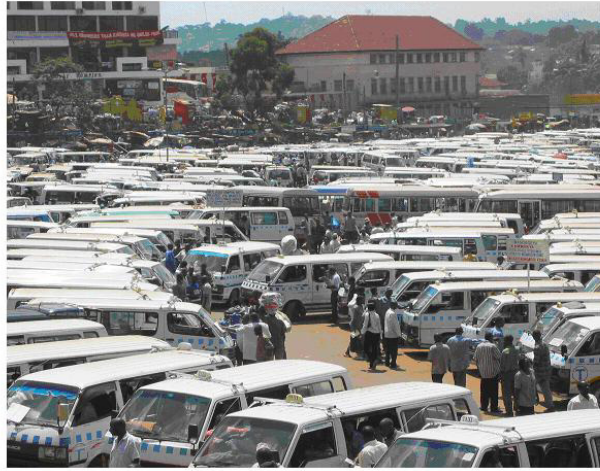
Kampala central taxi terminal

Known as taxis, the minibuses operate on the main radial roads without fixed stops or timetables. Drivers pay a daily fee to the owner and are responsible for fuel and terminal charges. Taxis wait for passengers in “taxi parks,” large open areas serving as a kind of terminal. Under a fee-based franchise contract with the Kampala city council, UTODA manages the two main terminals. The franchise contract must be renewed periodically and is theoretically subject to a public competitive tendering process, though UTODA has maintained control of the terminals since 1986.