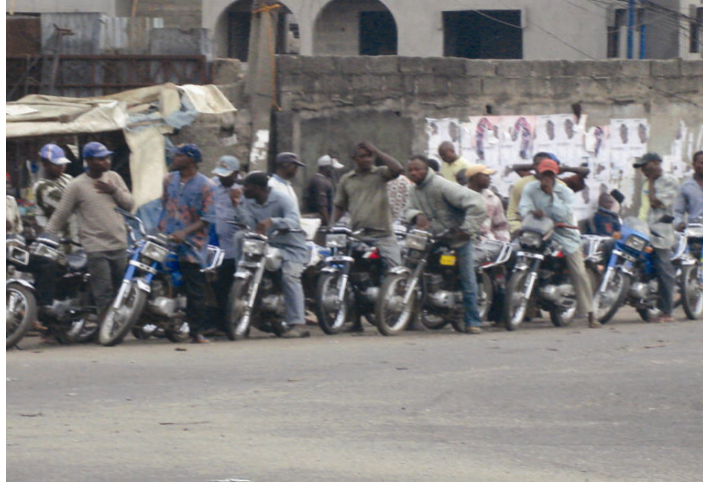
Motorcycle taxis in Lagos await passengers

The Lagos state government recently banned the circulation of commercial motorcycles (commonly known as okada ) between 7 p.m. and 6 a.m. According to the state police commissioner, the move came in response to a spike in robberies, holdups, homicides, and acts of harassment committed using motorcycles as the getaway vehicle. The punishment for violating the ban includes seizure of the motorcycle and a fine of ₦ 50,000 ($400). The ban has led to the disappearance of motorcycles from many parts of the city, leaving many commuters with no way to and from work. Transport fares have tripled with the contraction in supply.